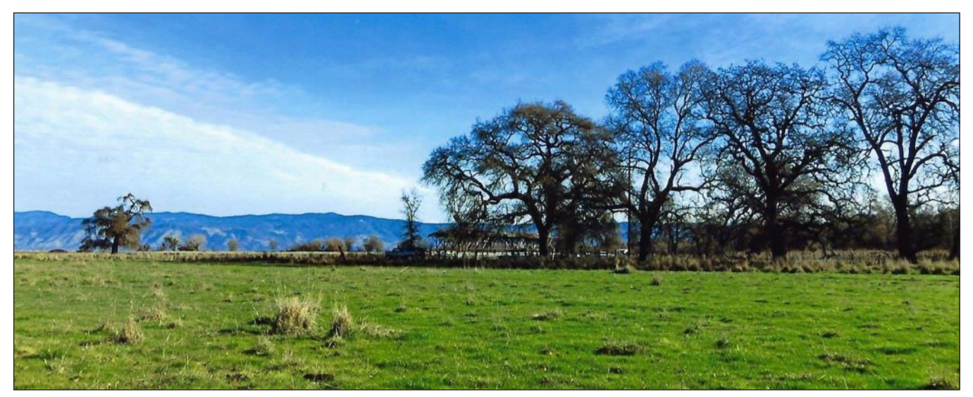
The Wright Property also features Valley Oak and open grassland.