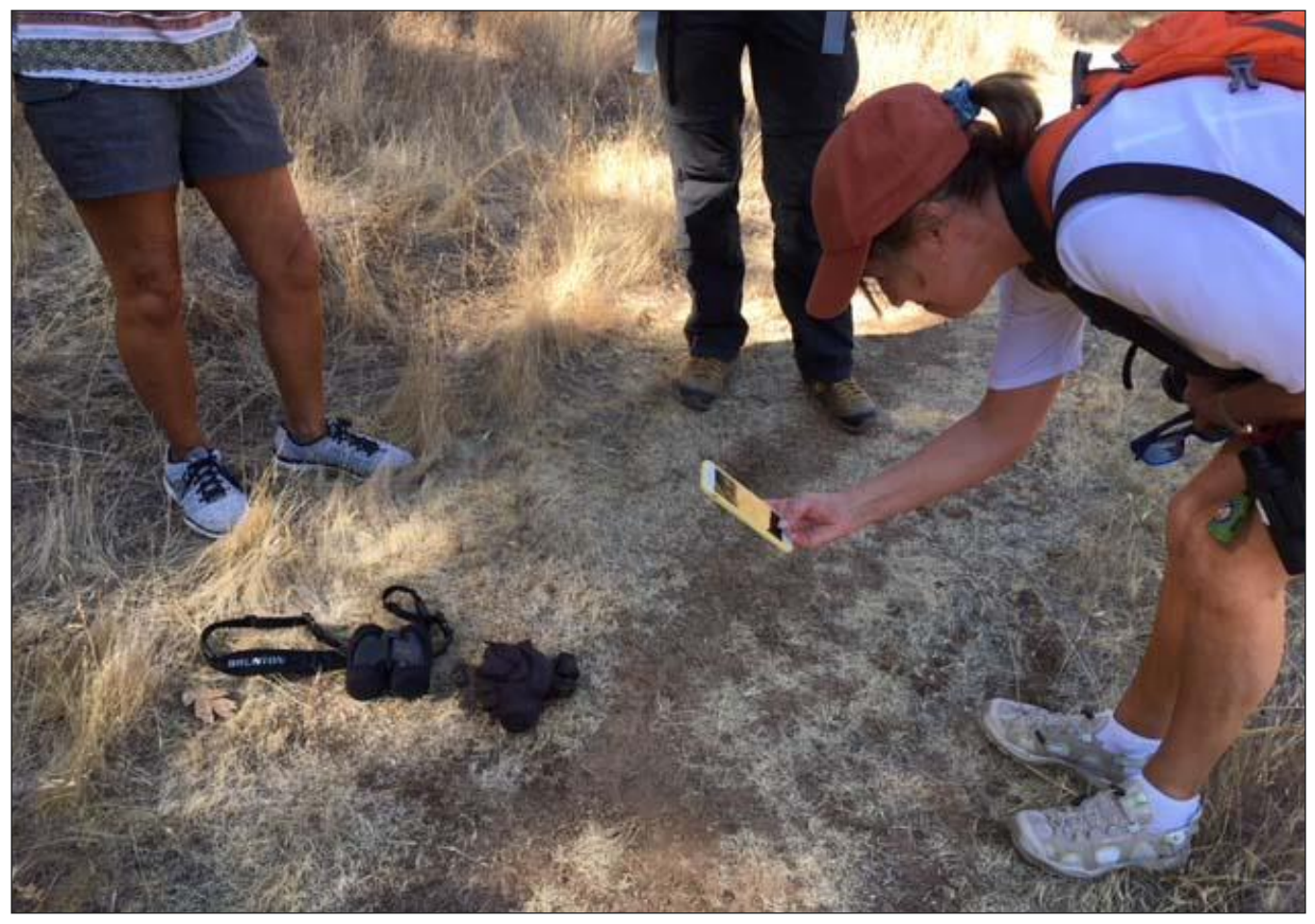
One of our most commented on pictures on our Facebook page has been the discovery of bear scat at the Rodman Preserve. He/she seems to like it there as on every walk we find fresh evidence.