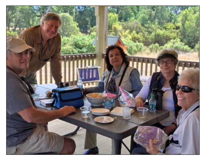
The Redbud Audubon and Napa Solano Audubon folks enjoyed lunch on the back porch at Rodman Preserve.