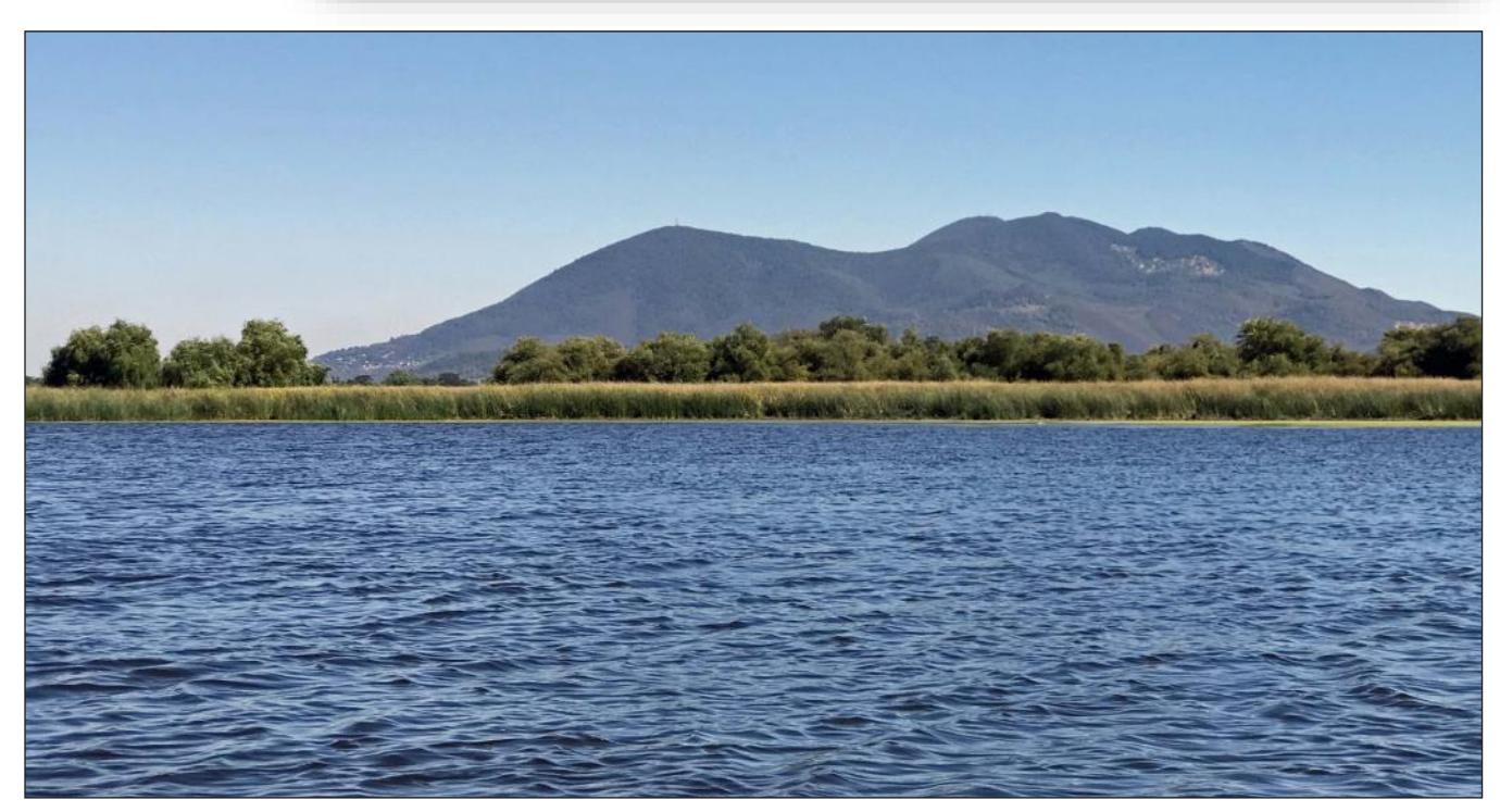
Untouched shoreline habitat at the Wright property near Lakeport.