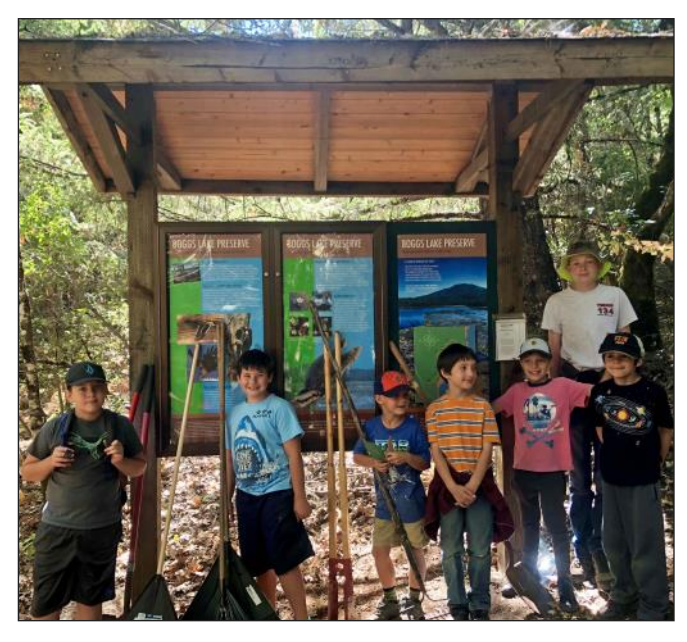
Cub Scout Pack 315 was a great help during the day.

home for a board and staff-provided luncheon and great company.