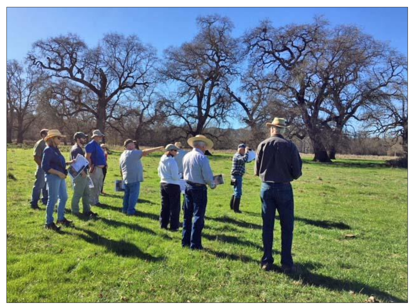
LCLT board members, supporters, and Fish and Game biologists visited the property last Spring.