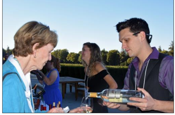
Lake County wines, donated by numerous wineries were a popular feature of the event.