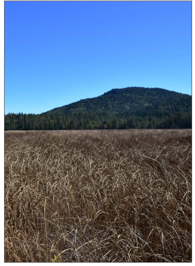
Lovely view of Mt. Hannah behind Boggs Lake.

It was heartening to have members from Cub Scout troops 315 and Boy Scout troop 134 there to complete work in order to earn badges in outdoor responsibility and stewardship. When the hard work was concluded, the group was welcomed to friends' of the Land Trust's