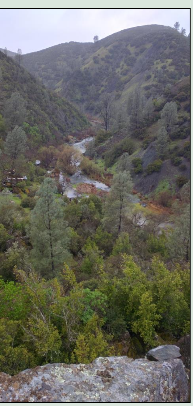
The Lake County Land Trust was able to help protect the Silver Spur Ranch. Pictured are two views of the beautiful Silver Spur Ranch property.