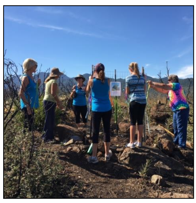
A group of participants hiked up Rabbit Hill to tie ribbons on the fence surrounding the newly planted McNab Cypress. The ribbons represented intentions for the community.

Volunteers will water and care for the trees. The Land Trust would like to encourage anyone in the Middletown area who is interested in getting more involved with the Rabbit Hill Park to please call the Land Trust office at (707) 262-0707.