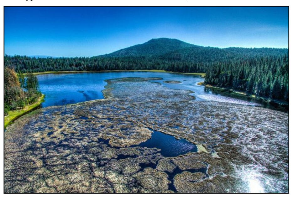
A drone picture of Boggs Lake.