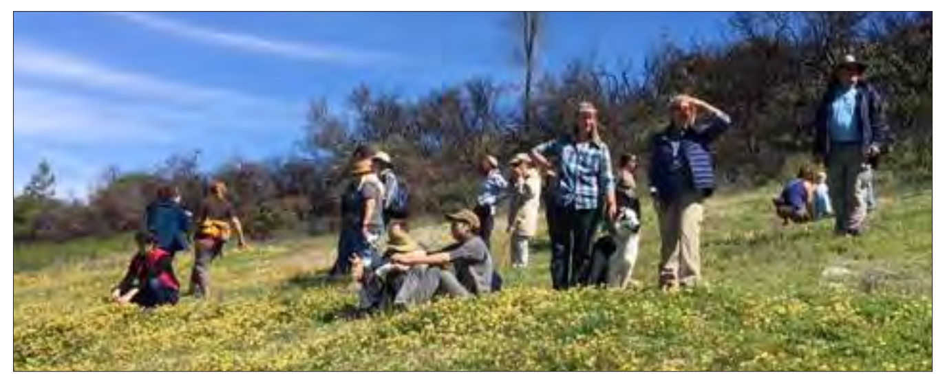
Enjoying total immersion in wildflowers during the Wildflower Walk & Conservation Celebration.