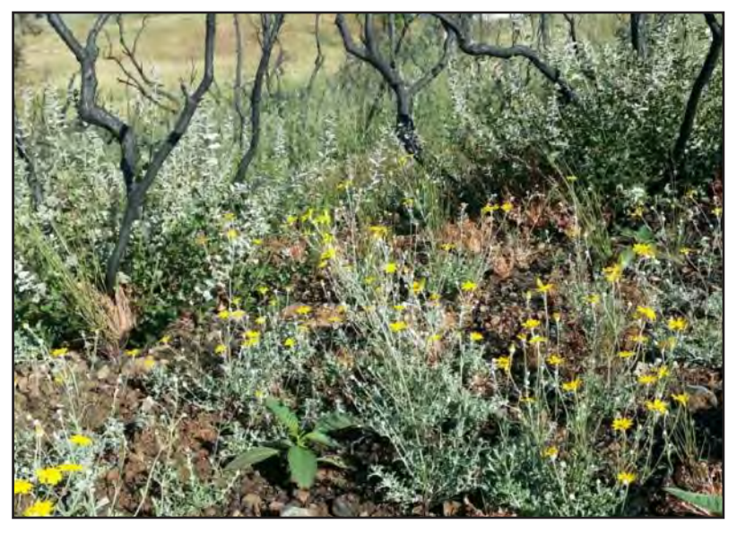
Common Woolly Sunflower and young Yerba Santa at the Rabbit Hill Preserve show off well against a backdrop of vigorously resprouting Leather Oak.