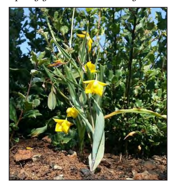
Diogenes Lantern is enjoying the full sun this year.

Rabbit Hill Preserve is vibrantly displaying its vigorous spring growth stimulated by last summer's fire