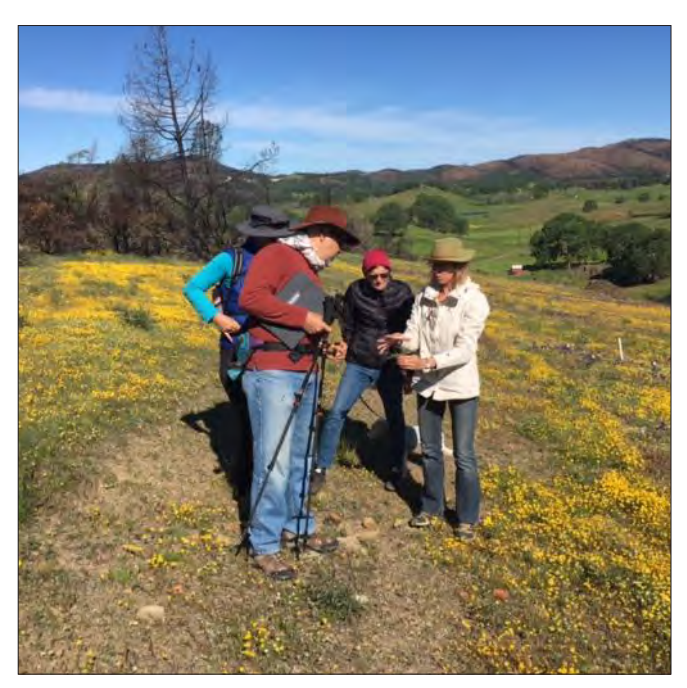
Wildflower walk attendees consider an interesting plant specimen.

While conservation easements typically focus on enabling a private land owner to protect the conservation values of their private lands, some easements involve partners that may offer wildland experiences to the public. A unique partnership involving the Lake County Land Trust (conservation easement holder), Tuleyome (conservation organization and conservation buyer), and the University of California's Natural Reserve System (property owner) offered wildflower enthusiasts a chance to visit one of the Land Trust's conservation easements in eastern Lake County in April. This group of partners has been working for two years to protect a 23 acre parcel with sensitive serpentine meadows and wetlands, located adjacent to the Univer-