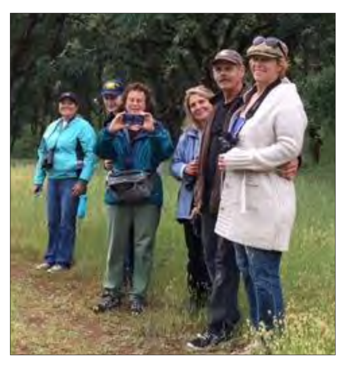
Spring is also a great time to enjoy the Preserve. This group showed up for the May 2016 walk and enjoyed viewing the native California bunch grasses and wildflowers.