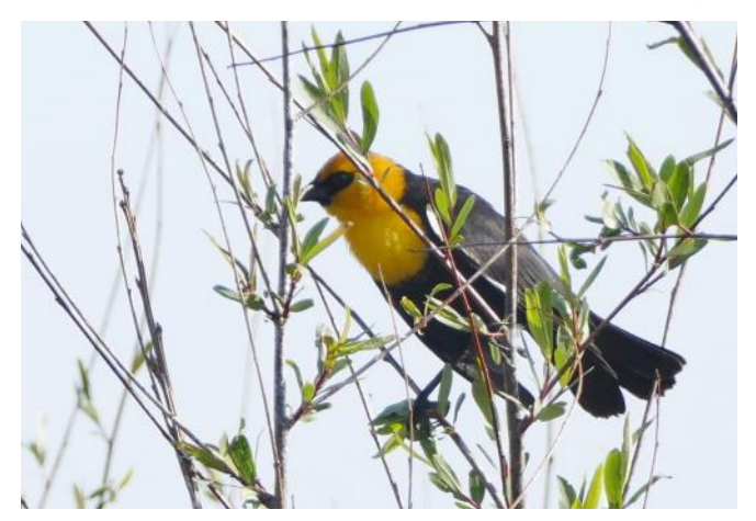
Yellow-headed Blackbirds flock to the tules and willows along the shoreline.