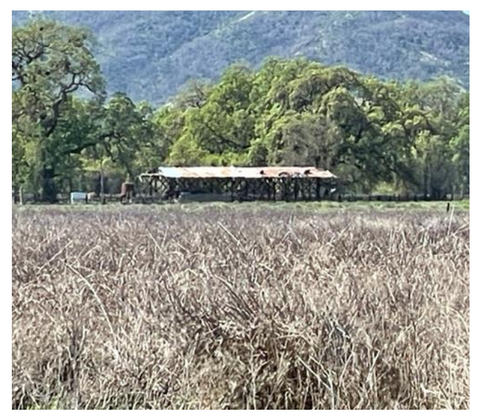
A sea of tules on the Preserve that will be replenished by a natural flow of lake water.

The channel on the Wright Wetland Preserve that was dug in the 1970s. The levee along the channel will be breached in three places to allow more water into the natural wetland area of the preserve.