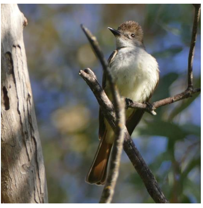
Ash-throated Flycatcher at the Wright Wetland Preserve.