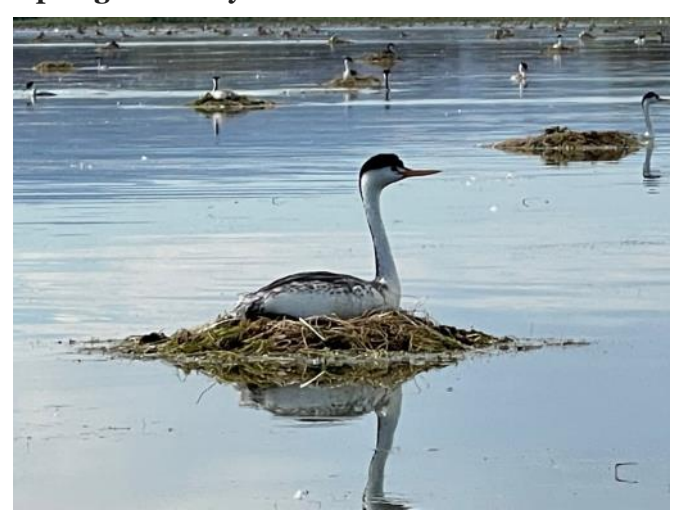
Western and Clarks Grebes are nesting in large numbers offshore of the Wright Wetland Preserve, all the way over to Library Park in Lakeport. Nesting grebes have also been reported off of Robin Hill.