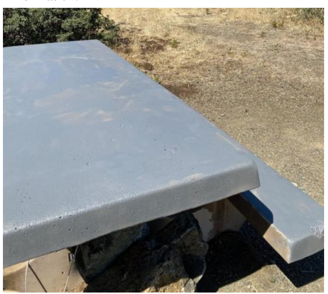
The refurbished picnic table.

The Lake County Land Trust, founded in 1994, is a charitable non-profit dedicated to protecting natural habitats, wetlands and valuable open space in Lake County; go to <a href="https://www.lakecountylandtrust.org">www.lakecountylandtrust.org</a> for more information.