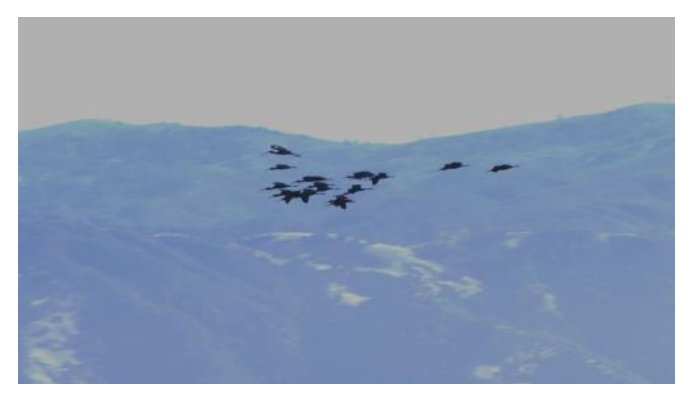
White-faced Ibis were a rare sighting in the Spring.