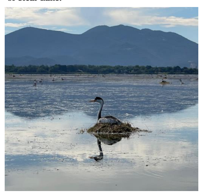
Grebes are building their nests using water weeds on the lake. Once the babies hatch, they will ride on their mother's backs.