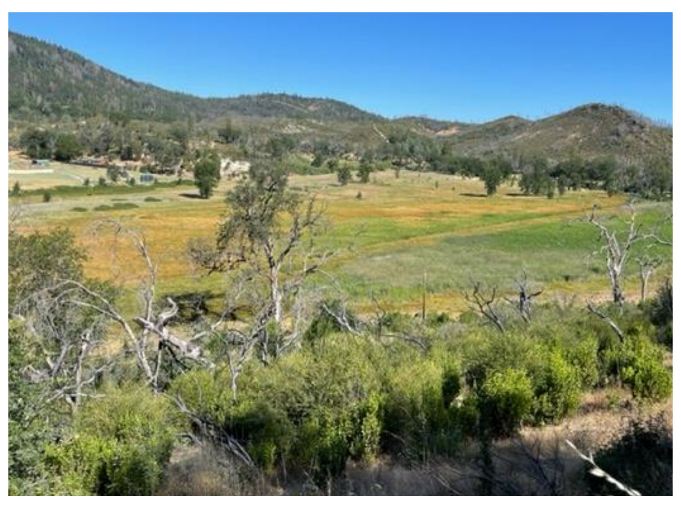
A view of the Seigler Valley Wetland Mitigation bank from Perini Road.