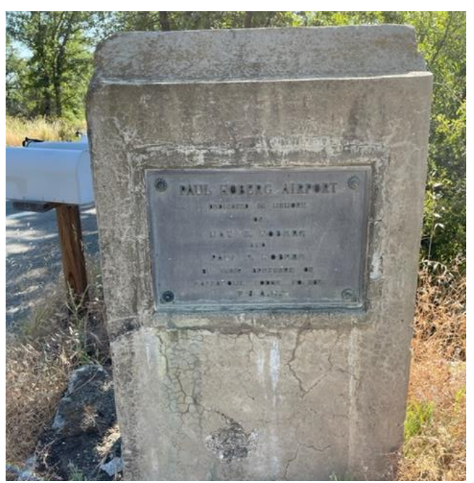
This historical monument marks the dedication of the old Hobergs Airport which is now part of the Seigler Valley Wetland Mitigation bank.

The mitigation bank is located near the old Hobergs Airport at the corner of Big Canyon Road and Seigler Springs Road. It is private property and a wildlife preserve but can be viewed from a couple of different turnouts, or by driving a short distance up Perini Road. It is a beautiful and important addition to Lake County's open space, providing habitat for mammals, birds, and native plants.