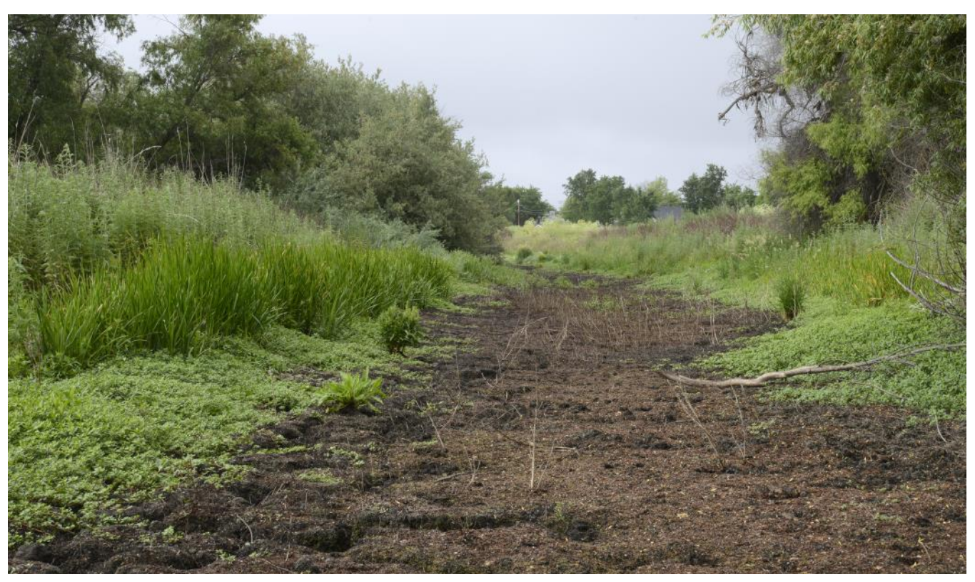
The dry channel at Melo where the rare Bur reed was found.