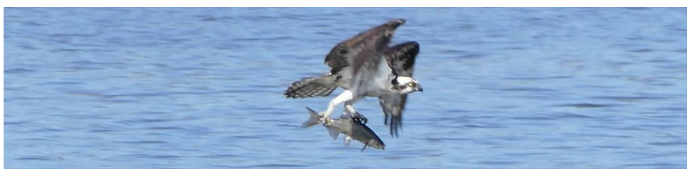
Osprey are often seen hunting along the Wright Preserve shoreline.

The Marsh Wrens were back in the tules and willow thickets, along with Red-winged Blackbirds, Song Sparrows, Common Yellowthroats and a few Yellow-headed Blackbirds. (See more photos on next page)