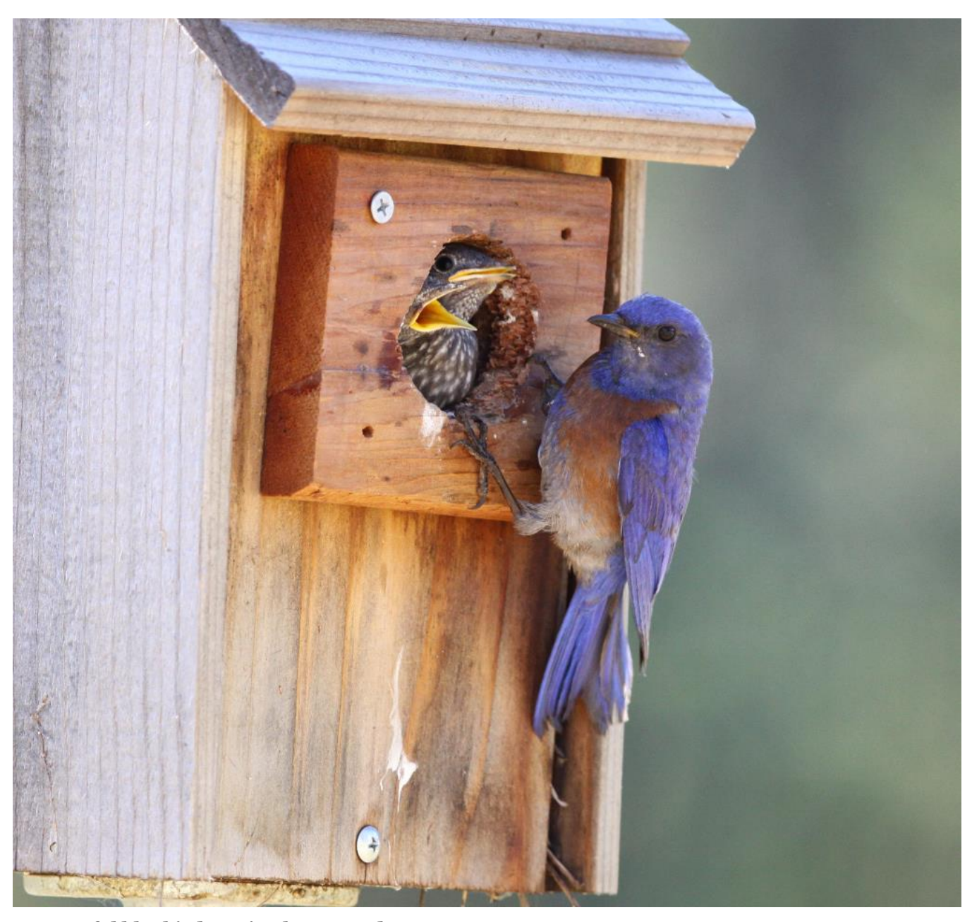
Successful bluebird nesting box at Rodman Preserve.

Sign up with Meetup.com and find activities